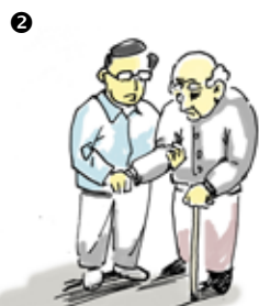
Dependency on family members and caregivers