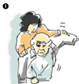
Help needed for the activities of daily living

Details about the 10/66 intervention 'Helping Carers To Care' can be found on our website ( www.alz.co.uk/1066 ) along with the complete study resources and materials.