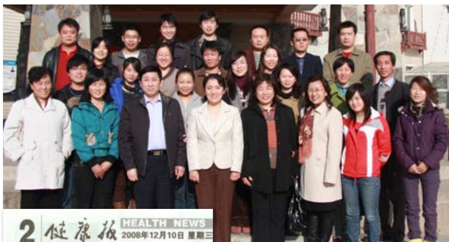
ABOVE The 10/66 Chinese team