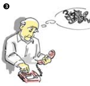
Examples of forgetfulness especially of recent events and names

Cartoons are used to display typical situations that the caregiver faces and has to deal with. We produced different series to be used within different cultures. These three are from China.